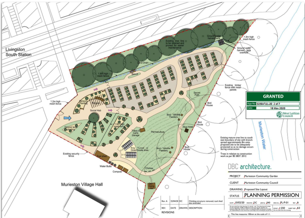
Figure 2: Planning permission obtained by Murieston Community Council – including a social hub with pergola, raised beds, shed, greenhouses, and a permaculture area