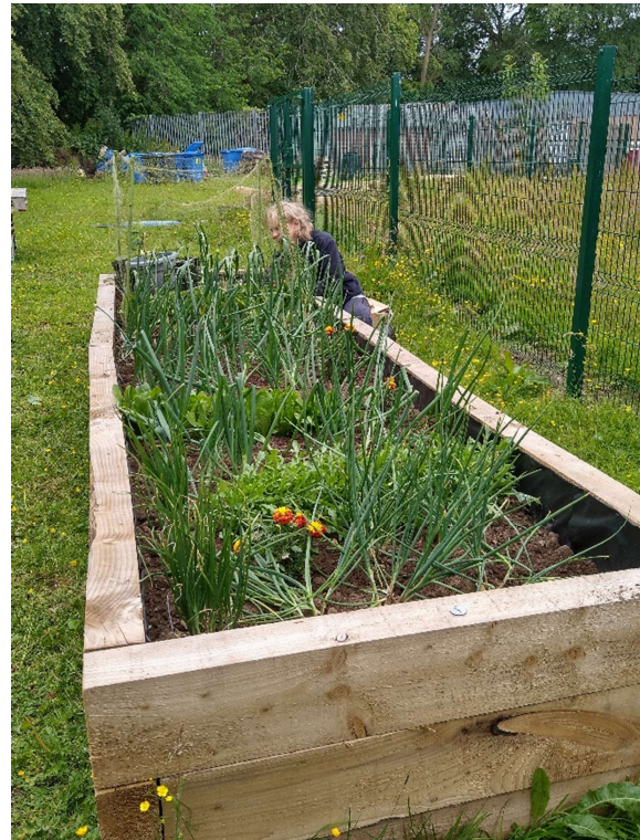
Figure 6: First produce from the first raised bed