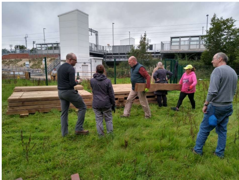
Figure 4: Enthusiastic volunteers helping to move the donated sleepers into the garden