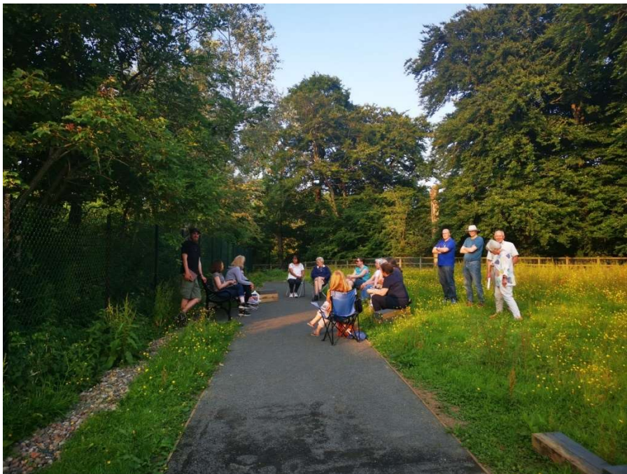
Figure 3: On-site inauguration meeting of Murieston Community Garden (July 2021)