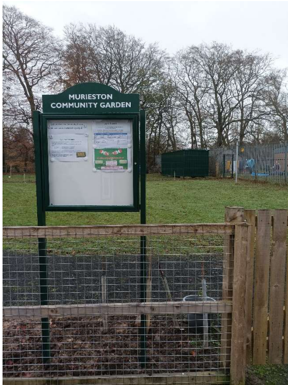
Figure 5: Garden sign with shed in background