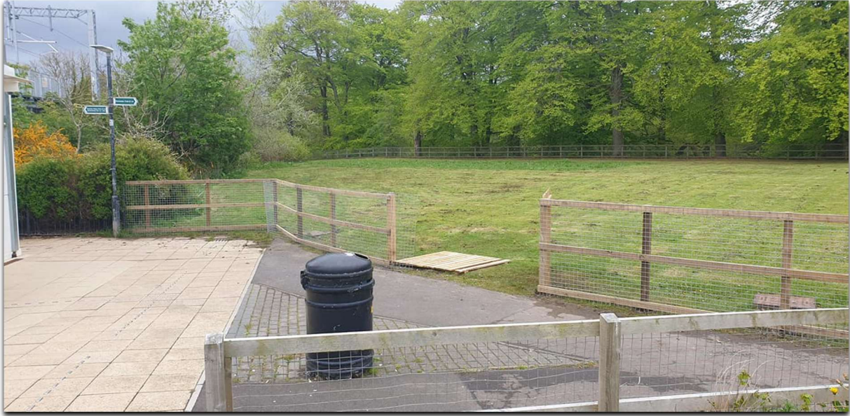
Figure 1: Erection of front boundary fence on plot of land provided free-of-charge by West Lothian Council. The Community Garden comprises the entire enclosed green space (0.5 acre).