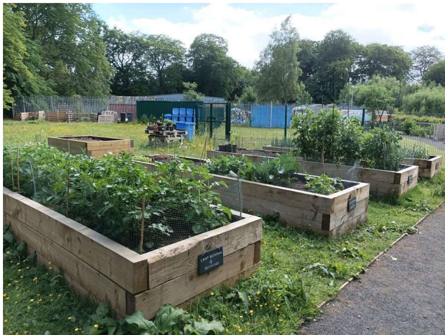
Figure 8: The flourishing back garden in June 2023

A huge thank you also to Murieston Community Council for ordering the sleepers for us and to the councillors who provided so much support.”